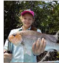
Contact Us if you'd like to Contribute - Most Welcome

This magazine is published by The Line Burner business of Port Douglas & welcomes any Far Nth Qld contributions including editorials & photographs. The views expressed in this magazine do not necessarily reflect the views of the magazine, the editors, or the authors themselves. The magazine does not guarantee accuracy, validity, honesty or politeness of content, and we shall not be held responsible for the content of mentioned websites. The content (photos, art, articles etc...) found within are the property of the submitter and not our magazine. Contacts: Ph 0409 610 869 www.fishingportdouglas.com.au info@fishingportdouglas.com.au Fishing Port Douglas Po Box 108 Port Douglas 4877